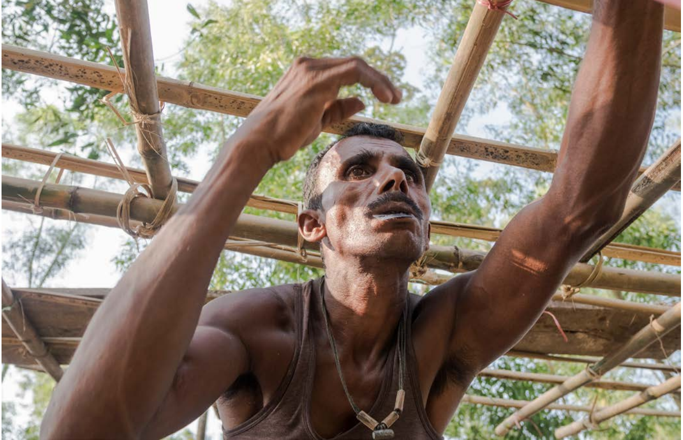
Many refugee families can be seen building their shelters with bamboo in Thangkali camp.

Given that shelters had already been constructed but were far below standards in terms of living conditions and structural integrity, rather than using bamboo in the emergency kits the sector developed and promoted the shelter upgrade kit (USK), or phase 2. This kit consists of tarps, bamboo, fixings, tools and technical assistance with the aim of improving living conditions (with site improvements contributing to the effort) and shelter structural stability to better withstand climatic conditions. Because of the scale of the crisis and the urgency to respond before the monsoon season, the Shelter and NFI Sector decided in November to reorient whatever was already in the pipeline for ESK, toward the USK. The ESK had included four bamboo Borak and 55 Bamboo Mulli, whereas the USK includes four bamboo Borak and 60 bamboo Mulli per household.