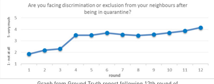
Graph from Ground Truth report following 12th round of quarantine survey