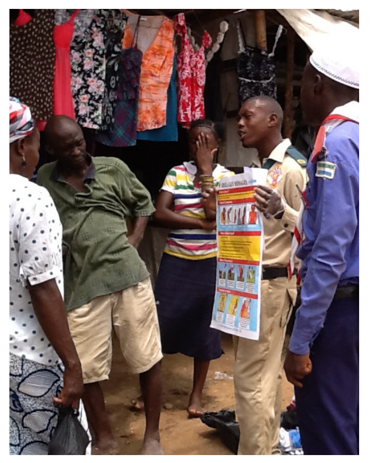
Traders receiving Ebola Messages.