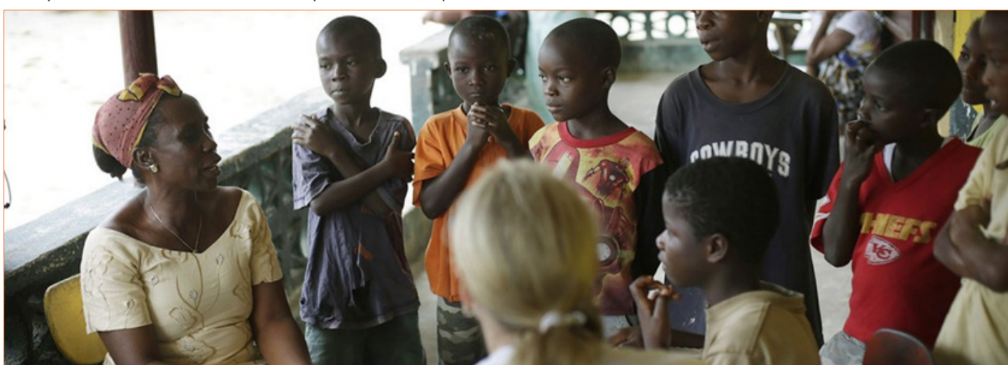
tiki-toki.com: "Save the Children Ebola response" (8 August 2014)

Graphs from Ground Truth report following 12th round of quarantine survey