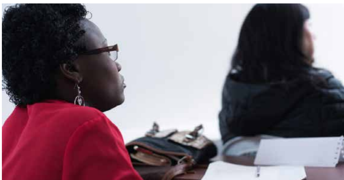
Colombian woman participating in a workshop in Quito.