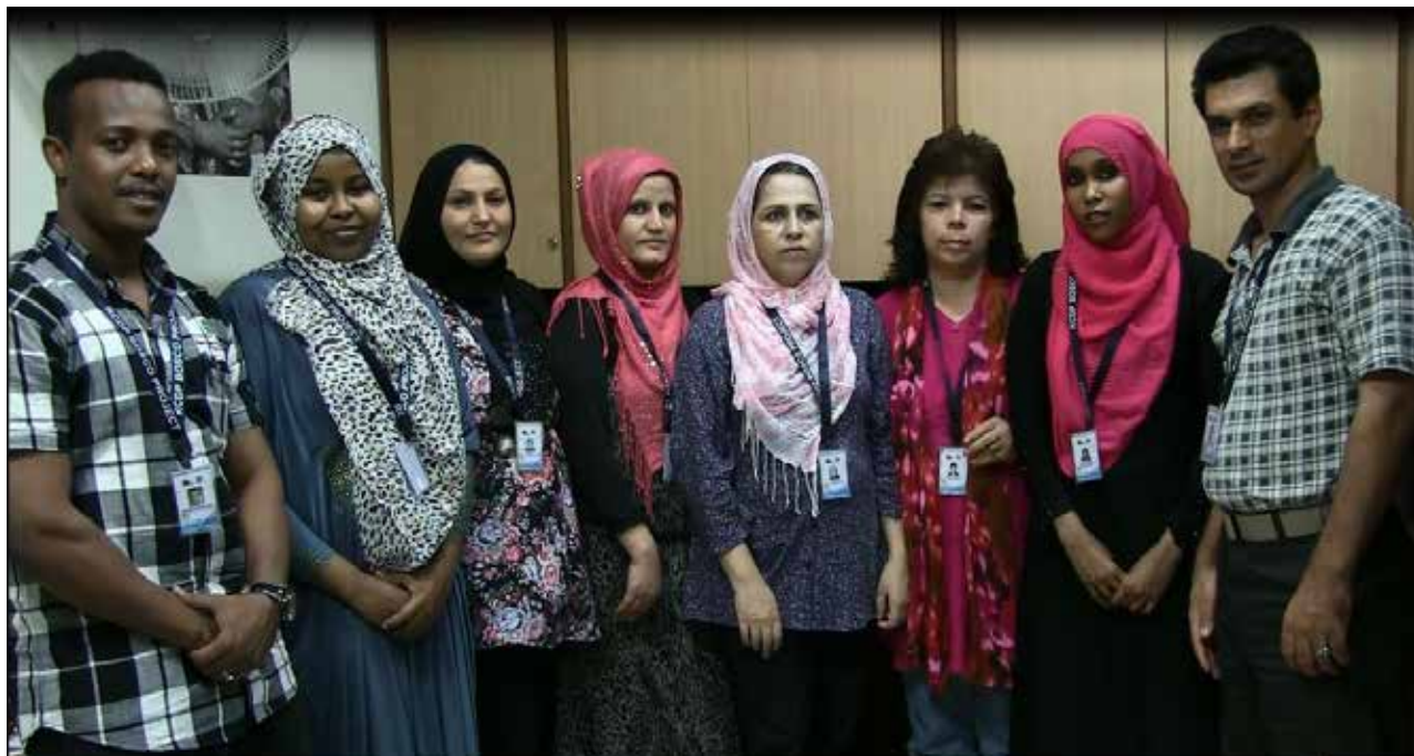
The RCDP Team in Delhi.