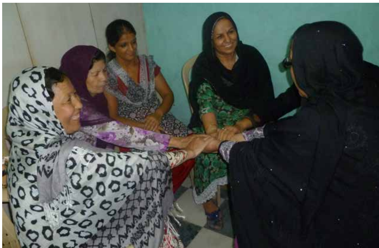
Afghan women in Delhi participating in a group activity run by the Refugee Community Development Project.

From the onset of urban response, UNHCR must consider which potential local partners currently have the skills, capacities, sensitivities, and personnel to serve all refugees and/or particular subpopulations; what additional training and recruitment is needed to bring local partners' service provision and GBV case management up to humanitarian standards, including the survivor-centered approach called for in the IASC Guidelines; 10 and what meaningful feedback and accountability mechanisms can be put in place for their implementing partners, mindful that certain groups of refugees may have greater or less access to any one mechanism.