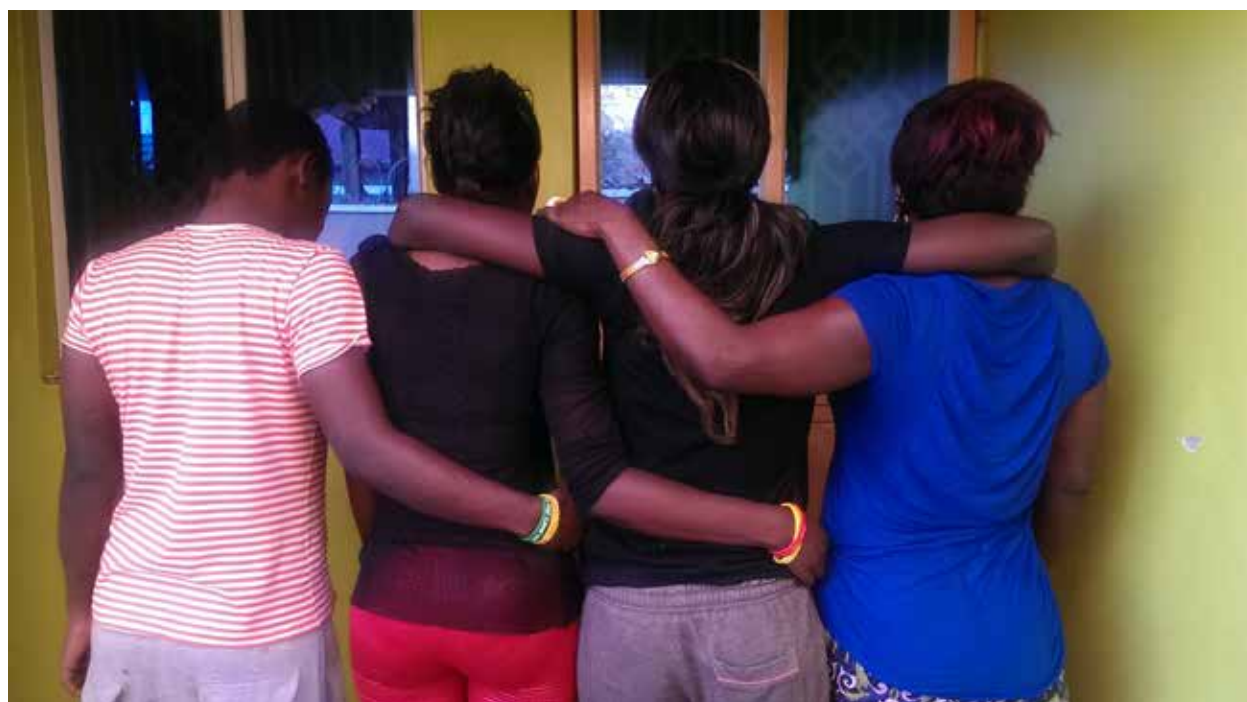
Refugee sex workers in Kampala.

Yet refugee sex workers feel strongly that they experience more frequent and more severe risks of violence than host community sex workers. As refugees, they experience additional layers of discrimination, stigmatization, isolation, and risk because of where they are from, the language they speak, and the color of their skin. Many refugees also fear that if anyone – from police officers, to refugee service providers, to neighbors – finds out they are selling sex it could compromise their asylum claim