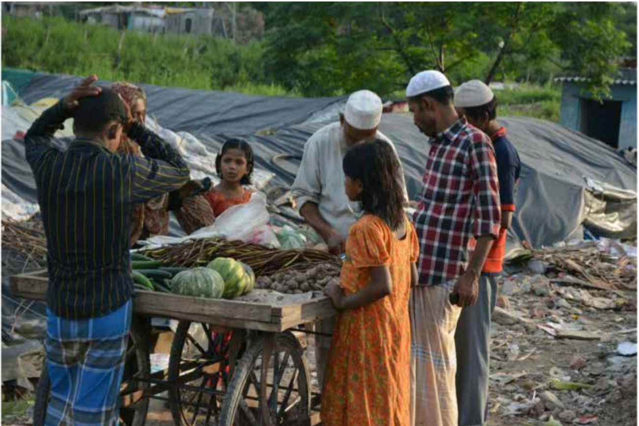
Rohingya refugees in Delhi.

UNHCR's local partners can be sites of intense discrimination for certain groups of urban refugees. Where local laws and social norms support discriminatory practices, UNHCR partners have a special responsibility to not only sensitize staff, but also provide training and operational guidance on engaging at-risk groups and on what meaningful feedback and accountability mechanisms can be put in place for their implementing partners.