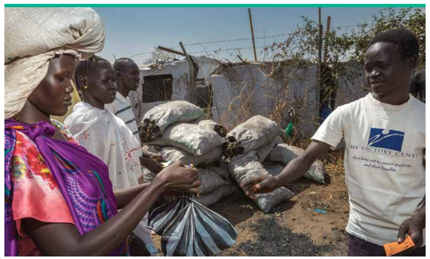
UN House (Protection of civilian Site), Juba, South Sudan, February 2014: a beneficiary of the charcoal voucher project is exchanging her voucher for 2 bags of charcoal that will enable her to cook for approximately a week. Small traders who were operating in the camp prior to the project were selected to be involved in the voucher scheme.