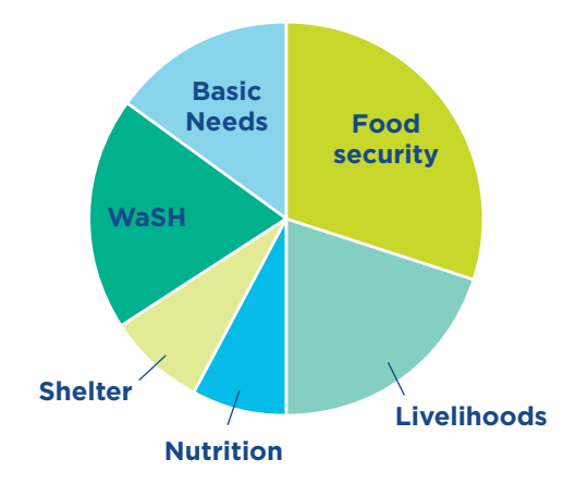
Sector Focus of Case Studies in this Review

Four of the fourteen interventions reviewed for this study represent the food-security sector. The remainder of the interventions studied fall under these categories, as illustrated in the graph: three under livelihoods, one under nutrition, one under shelter, three under WASH, and two under basic needs.