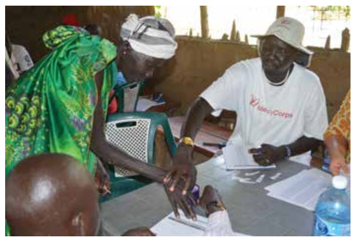
Cash tranche being delivered to beneficiary households, DFID Funded ECT Program, South Sudan, May 2015

Most of the challenges flagged by practitioners interviewed on the subject of monitoring indirect market interventions came down to the