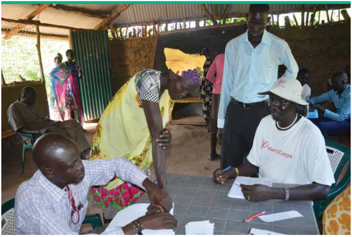
Cash tranche being delivered to beneficiary households, DFID Funded ECT Program, South Sudan, May 2015. The program also provided cash grants to traders, to stimulate both supply and demand.