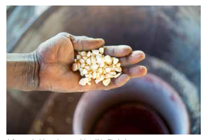
A farmer holds maize over his mill in Zimbabwe.

Description of the market-strengthening activities: Zimbabwe had a significant deficit in maize production in 2010, so the market was