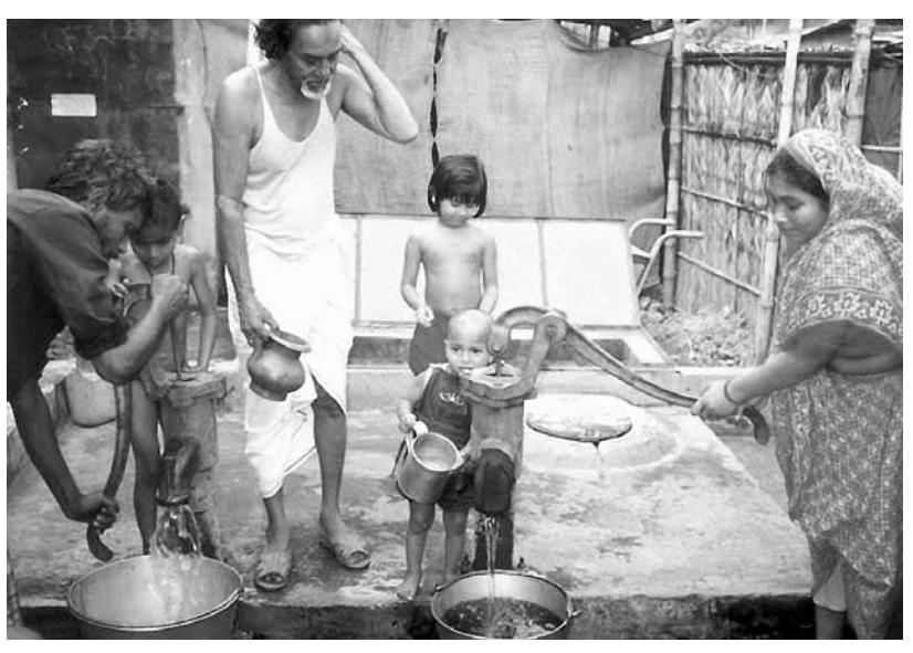
Photo 1: Water points consist of an underground storage reservoir, two handoperated pumps and space for bathing and laundry

Water points provide the means by which slum dwellers can access the formal water supply system (Photo 1). They consist of an underground storage reservoir, two hand-operated section pumps and space for