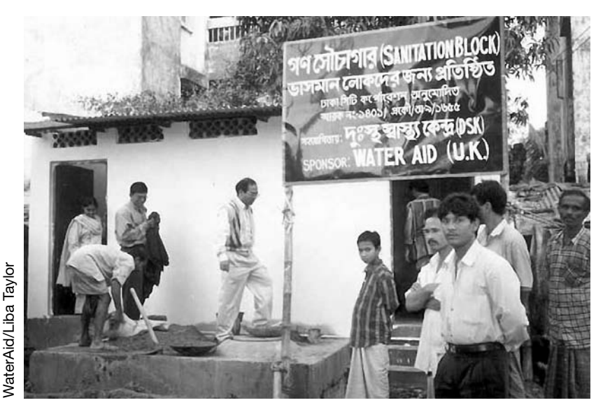
Photo 2: Sanitation blocks, which include latrine stalls, urinals and bathing space, are designed to serve up to 500 people