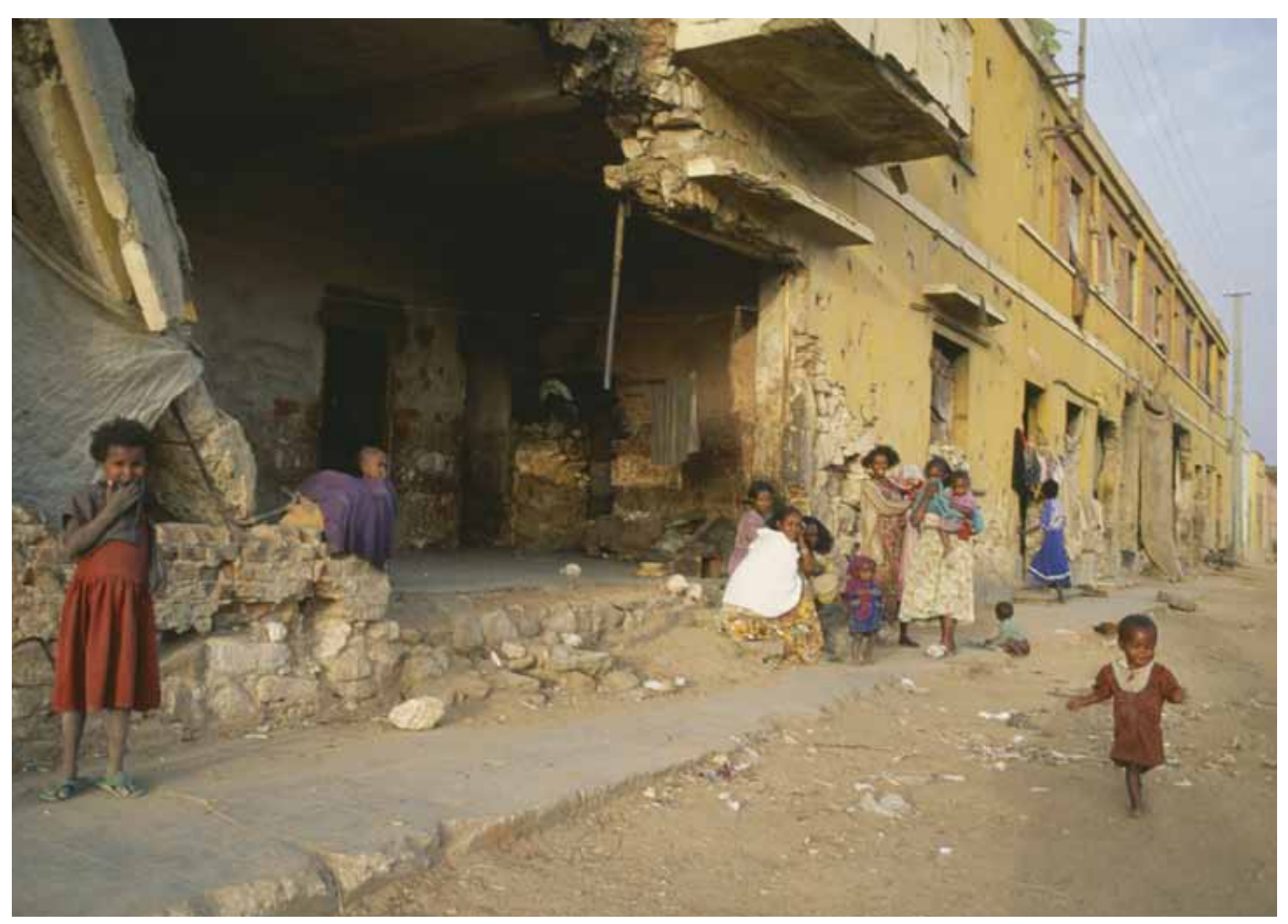
Displaced women and children in a war damaged building in Decamare, Eritrea.

■ Many of those displaced to urban areas live alongside other urban poor in slums/informal settlements where resources and services are