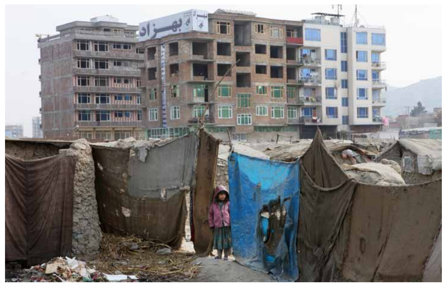
Displaced peoples camp in Kabul, Afghanistan.

Most studies advocate on behalf of urban refugees/IDPs and do not consider the impacts of their urbanisation on settled populations as well as on municipal and national authorities. Little is known about the impact of displaced communities on the cost and availability of food, housing and jobs. While many urban communities of displaced people have been around for years, their existence has not been