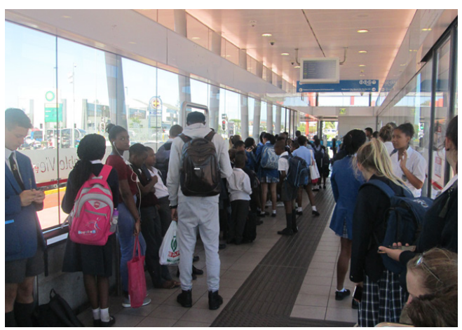
Students from different schools waiting for buses at the Tableview MyCiti Station to Parklands and other destinations.

Except for two meetings I had with groups of students (one at the McDonald's eatery in Maitland and the other in the Cape Town Central Library), most of my interviews were at informal places like the train stations or the public taxi and bus stands. Interestingly, it was in these environments that the students divulged more information and were quite relaxed.