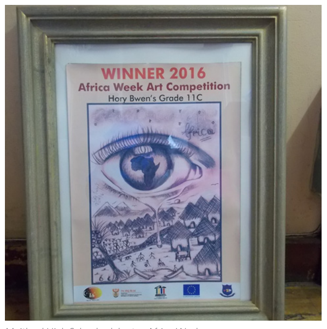
Maitland High School celebrates Africa Week

stay to the end of the year. Another encouraging gesture is that the schools are proud of their alumni that have made it to the top universities in the country. They sometimes bring them back to say a few encouraging words to matriculants and attend award ceremonies. Among them are foreigners.