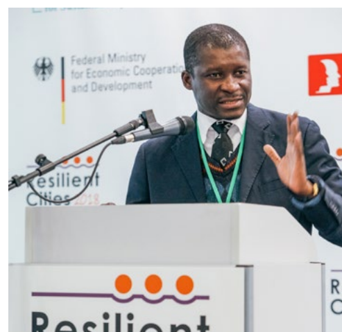
Manuel de Araujo, Mayor of Quelimane, Mozambique and Co-chair of ICLEI Resilient Cities Portfolio

Citizen participation is at the heart of such vision. Copenhagen, Denmark has a long-standing history of organizing active dialogues between citizens and planners to upgrade socially-marginalized neighborhoods, such as the St. Kjelds Quarter, and transform them into green, climate-adapted and integral parts of the city. Istanbul Metropolitan Municipality, Turkey is following the example of Copenhagen in its inclusive, citizen-centered approach to implement its Urban Transformation Project (see page 15). Such government efforts to directly engage citizens should ideally trigger bottom-up monitoring mechanisms that would ensure the “participation” is genuine and the outcomes of the policies and plans are strengthening social cohesion and community resilience.