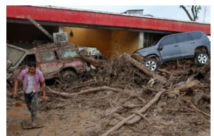
The consequences of the landslide in Mocoa, Colombia.