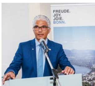
Ashok Shridharan, Mayor of Bonn; Co-Patron of Resilient Cities 2018