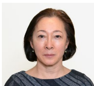
Mami Mizutori, Special Representative of the SG for Disaster Risk Reduction; Co-Patron of Resilient Cities 2018