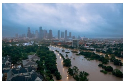
The aftermath of Hurricane Harvey in the city of Houston, USA.

* This is a term used by the insurance industry to signify disasters owing to nature forces, as opposed to “technical” or “man-made disasters”, e.g. conflict, terrorism, mining accidents. Though, the international resilience community widely accepts that since the causes of climate change are man-made, the disasters are also not “natural”, but rather unnatural consequences of man-made decisions.