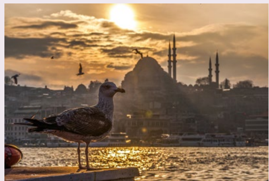
Istanbul landscape.