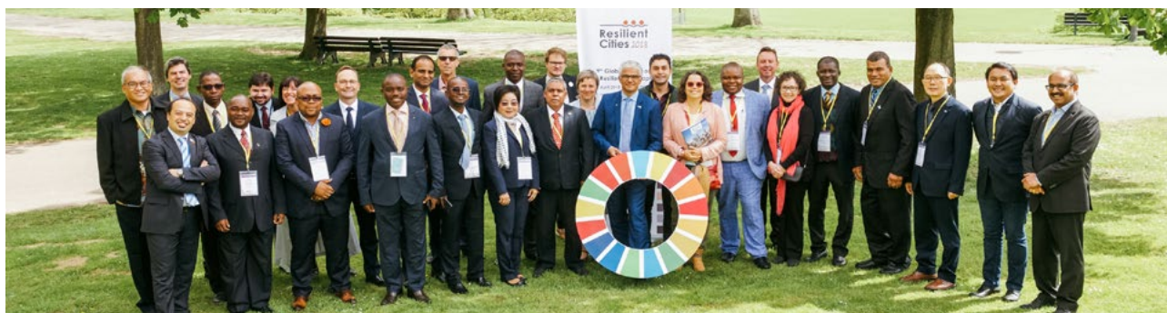
Mayors' Lunch during Resilient Cities 2018 congress