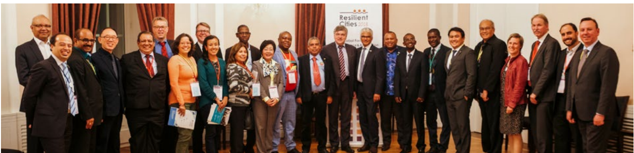
The Talanoa Dinner, hosted at Bonn's historic City Hall, represented a special highlight of the Congress. Mayors and local government representatives had a chance to engage and share their knowledge according to the Talanoa format

At the special Talanoa Dialogue and Dinner on 27 April, delegates reaffirmed the importance of engaging all levels of government in addressing climate change in the context of pursuing the SDGs and the New Urban Agenda (NUA). The dinner featured an innovative round-table discussion where delegates were encouraged to share one positive and one challenging story about finance, legal frameworks, and technical solutions in implementing the Paris Agreement. Building capacity and fostering integrated policy approaches to address the adverse impacts of climate change were highlighted as the main needs of local and regional governments. Delegates also agreed that the Cities and Regions Talanoa Dialogues are likely to strengthen the dissemination of relevant tools, training, and expert assistance and de facto provide the necessary technical support for assessing mitigation and adaptation needs with a view of following a low emission, resilient pathway.