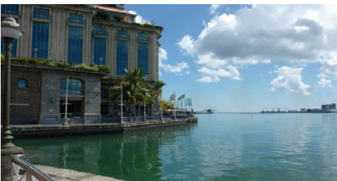
Port Louis, Mauritius, one of the SIDS at the frontline of climate change

Financing for adaptation projects of the scale necessary is lacking, making international help inevitable. For example, Fiji would need USD 4.5 billion to fund climate change adaptation measures – an amount close to the country’s annual GDP. The Fijian government to some extent has overcome such restraint by issuing sovereign green bonds to support adaptation projects (World Bank, 2017). The small island nation also raised international awareness of the immediate threats and needs of SIDS during its COP23 Presidency, where the Talonoa Dialogue was born (see page 7). At COP23, ICLEI and the Global Island Partnership (GLISPA) established the Frontline Cities and Islands , a movement of mayors and leaders of island economies who commit to advance local action to deliver scalable, integrated solutions to build resilience. Currently, through the Frontline initiative, ICLEI and GLISPA jointly support local governments’ capacity building for resilience, by offering risk assessment tools and facilitating multi-stakeholder Disaster Risk Reduction (DRR) workshops based on the Sendai Framework for Disaster Risk Reduction . The Frontline initiative also supports local governments to develop joint work programs and share solutions and develop innovative financing mechanisms.