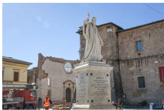
Norcia, Italy: aftermath of a 6.5 magnitude earthquake, which destroyed invaluable historical heritage.

At Resilient Cities 2018, local governments explained how they actively engaged with citizens to boost their feeling of identity towards the city and ownership of its cultural and historical wealth, while at the same time creating economic opportunities and taking measures to enhance urban resilience without altering characteristic areas. For instance, Guimarães, Portugal presented its best practices that led the municipality to become the European Union Capital of Culture in 2012, EU City of Sport in 2013 and the most sustainable city in Portugal in 2017. Guimarães credits its success to its engaged "eco-citizens", citizens who are proud of their municipality, culture and heritage. Similarly, Bologna, Italy displayed its installation of temporary green areas, such as overhead