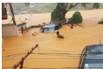
Mudslides in Sierra Leone mark the deadliest event of the year.