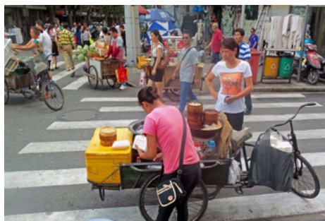
A woman preparing and selling hot food from the back of her bicycle in Shanghai.

Food and Agriculture Organization of the United Nations (FAO) in collaboration with RUAF Foundation implemented a city-region food system assessment in Lusaka, Zambia . According to the assessment, 60% of the food consumed in Lusaka comes from the city region, which provides the main commodities consumed by the urban population (fruits, vegetables, livestock, dairy products, and fish). Despite that, there is no single existing institution mandated to govern the food system within the city region and the current fragmented governing bodies scarcely collaborate.