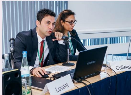
Delegation from Istanbul Metropolitan Municipality presenting the pilot Urban Transformation Project in Bayrampaşa District

A pilot Urban Transformation Project in Istanbul's Bayrampaşa District was recently launched to implement components of the IKDMP. The aim of the project was to transform the District into a green, livable and resilient part of the metropolis by applying the "Build-Transfer-Evacuate" Model. The Model entails constructing new safe buildings in unutilized state-owned areas, such as the District's former prison area [Build]; relocating the population of the adjacent risk area [Transfer/Evacuate]; and after demolishing constructions in the risk area, re-creating the empty space according to sustainability principles and citizens' needs. Much like a sliding puzzle game, this simple concept could support Istanbul's citizen-centered transformation vision. However, all puzzle pieces have to fit! Stakeholders of the transformation project included the private sector (e.g. realtors), the metropolitan government, as well as civil society groups such as a reconciliation committee. One of the most successful and thriving elements of the project has been the active consultation of citizens. By placing people at the focus and prominently relying on social studies, the physical structure of the project was shaped around the citizens' true priorities, such as the creation of a mosque square, proximity to social infrastructure, green corridors, and commercial streets.