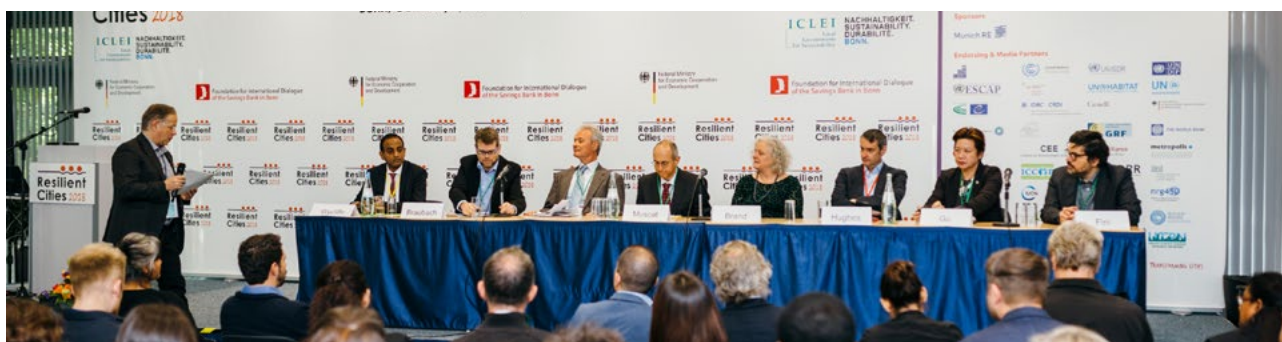
Resilient Cities 2018's special sub-plenary "Driving transformative climate change adaptation in cities through nature-based solutions"

In the meantime, greening fiscal policies could open doors for innovative financing mechanisms for NbS. Stuttgart, Germany for example, has introduced tax incentives and tailored financial programs to complete its green roof expansion strategy (ICLEI, TNC, 2017). Pooling efforts with multiple local governments might also prove helpful, as increasingly large scale donors like the European Union encourage cities to work together to receive substantial financial support for integrated sustainability projects. Lastly, providing incentives for cities and citizens could support the business case for NbS and bring about the necessary mentality switch away from relying on finite resources toward utilizing the existing natural and replenishable arsenal at cities' disposal to achieve sustainable urban development.