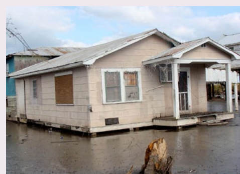
The aftermath of a hurricane in Isle de Jean Charles, Louisiana

Both projects are centered on citizen participation. Open meetings, constant engagement, and consultation with local communities have been crucial to the adaptation efforts. Such approach ensures that plans for integrated water management or relocation and re-definition of a community's new home are viable and sustainable practices.