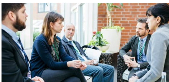
ICLEI-RUAF CITYFOOD Network meeting at the congress

Global urbanization trends combined with hunger and malnutrition rates, poverty, vulnerability to climate change impacts, as well as hard limits of natural resources to feed a growing world, have given rise to a vigorous debate on how to achieve a resilient and sustainable food supply in the near future. The achievement of the SDGs depends on substantial transformations of food systems – including their governance structures which drive policy planning at the local and national levels (FAO, 2017).