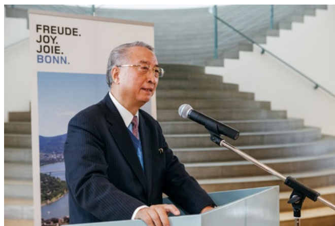
Zhang Xinsheng, President of the International Union for Conservation of Nature, during the Opening Reception hosted by the City of Bonn

Though long-term financing for local and subnational governments is theoretically available (through the direct access modality of the Adaptation Fund, for example), access to the available pot remains a challenge. The CitiesPCC Cities and Climate Change Science Conference highlighted that access could be