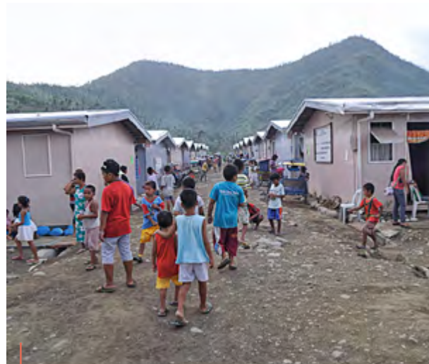
Life inside the International Pharmaceuticals Inc. bunkhouse community in Tacloban, one of the biggest cities affected by Haiyan. © IOM/Alan Motus, April 2014. https://flic.kr/p/n8snfX

The government initially recommended the establishment of a blanket no-build zone stretching 40 metres