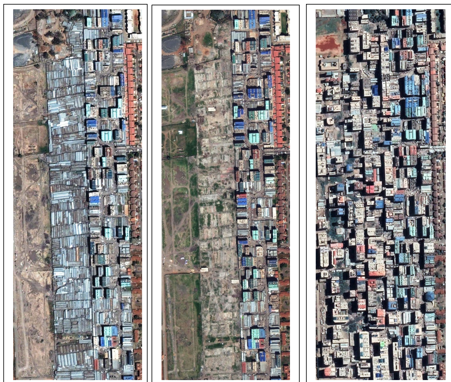
Figure 2: Shack to tenement housing transformations in Pipeline, Nairobi

Source: Google Earth Images: left to right from 2009, 2010, and 2018